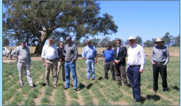
Seed produced by Australian farmers.

In summary, Avalon AR1 is safe for stock to graze, reduces the workload for the farmer and maximizes profits through no loss of production. The Australian breeding ensures Avalon AR1 has the pedigree to persist. About Endophyte